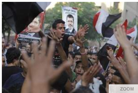
Egyptians celebrate the victory of Mohammed Morsi in Cairo in June. Some concerned Americans see the Arab Spring as a golden opportunity for Islamist politicians to undermine Washington.