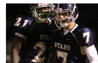
First round top games